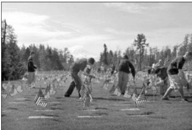
Maple Valley high school students

Cary Collins (Ph.D. '01) headed Operation Veterans Remembrance, a program that raised money to purchase flags for the Tahoma National Cemetery, located in Maple Valley, Washington. This is the only veterans' cemetery in the state. His high school students, surpassing their original goal to raise $6,500, made more than $14,000 to purchase more than 11,000 flags that were placed in the cemetery.